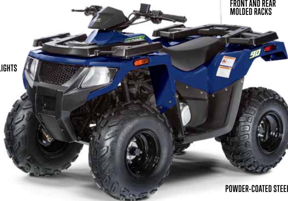
POWDER-COATED STEEL WHEELS